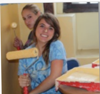
PAINTING CASA VICTORIA